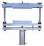
Guillotine Knife Assembly