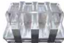
Custom Divider Sets