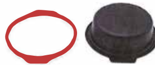
CUSTOM COLORS & DUROMETERS